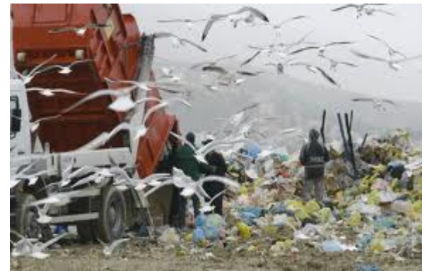
WASTE DISPOSAL KAREPOVAC