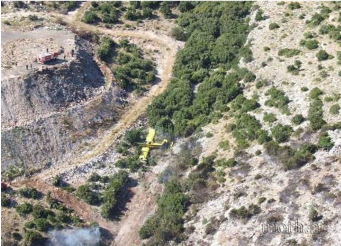
WASTE DISPOSAL "KOŠER" ON THE ISLAND OF BRAČ